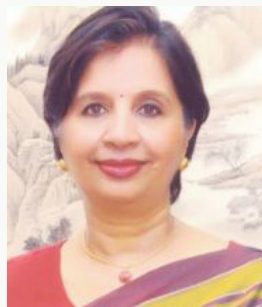
Her Excellency Ms. Nirupama Rao Ambassador of India to the United States