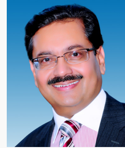
Hon. Ajit Kumar Consul General of India, CGI Atlanta