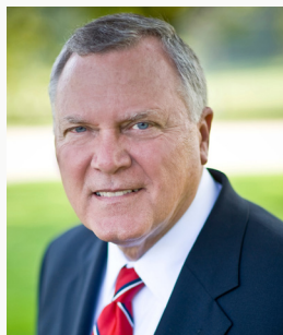
Hon. Governor Nathan Deal* State of Georgia